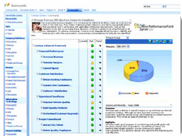
Personalized Web-based scorecards provide performance information to business users.