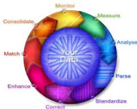
Figure 1: The Business Objects Data Quality Software Process Starts with Data Quality Measurement and Analysis, Proceeds to Data Cleansing and Consolidation, and Provides Reports for Project Results and Continuous Monitoring

Robust and easy-to-use data quality, optionally part of the data integration process, is a critical part of enterprise information management (EIM) solutions from Business Objects, an SAP company. EIM is a set of strategies, practices, and open technologies for delivering trusted, integrated, and timely information. Inside the Business Objects EIM framework, data integration, metadata management, text analysis, and data quality technologies combine to deliver trusted information right through the information supply chain – and right up to and including the point where it’s consumed by end-users.